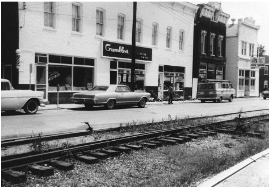
This photo show East Pearl Street looking east from Main Street. The railroad tracks run straight through downtown Batesville in the 1950's. The stores in the photo are Telles Barber Shop, Feltz's Tavern, Robert Schene Radio Repair, and Gambles Department Store.