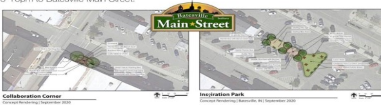
Collaboration Corner Concept Rendering | September 2020

Batesville Main Street, a community driven non-profit organization, is dedicated to creating a vibrant downtown district, where people will gather and businesses will prosper. We are working to build two outdoor gathering spaces in the heart of downtown for all to enjoy! Please join us to learn more about Main Street and to make these projects happen for our downtown! We will be accepting donations for these projects. In addition, The Sherman will donate 25% of all food and beverage sales from the Bier Hall and 10% of all f&b sales from the 1852 Restaurant, Black Forest Bar and curbside-pickup orders from this night between 5-10pm to Batesville Main Street.