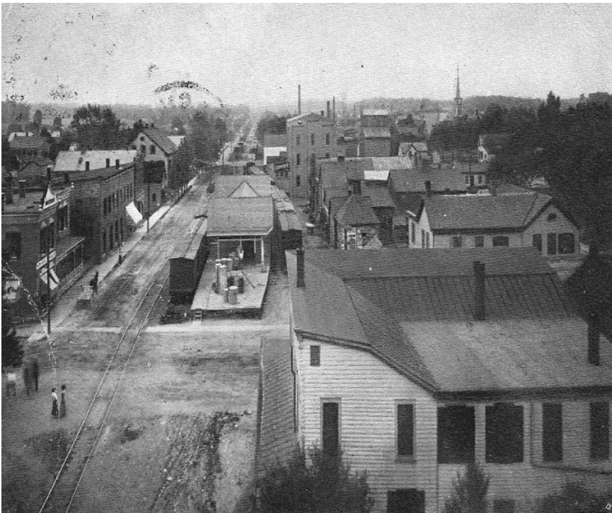
This was the second location of the train depot. It was situated directly across from the Sherman House at the southeast corner of Main and East Pearl streets. The last passenger train to pass over this old railroad bed of 1852 was on July 2, 1906.