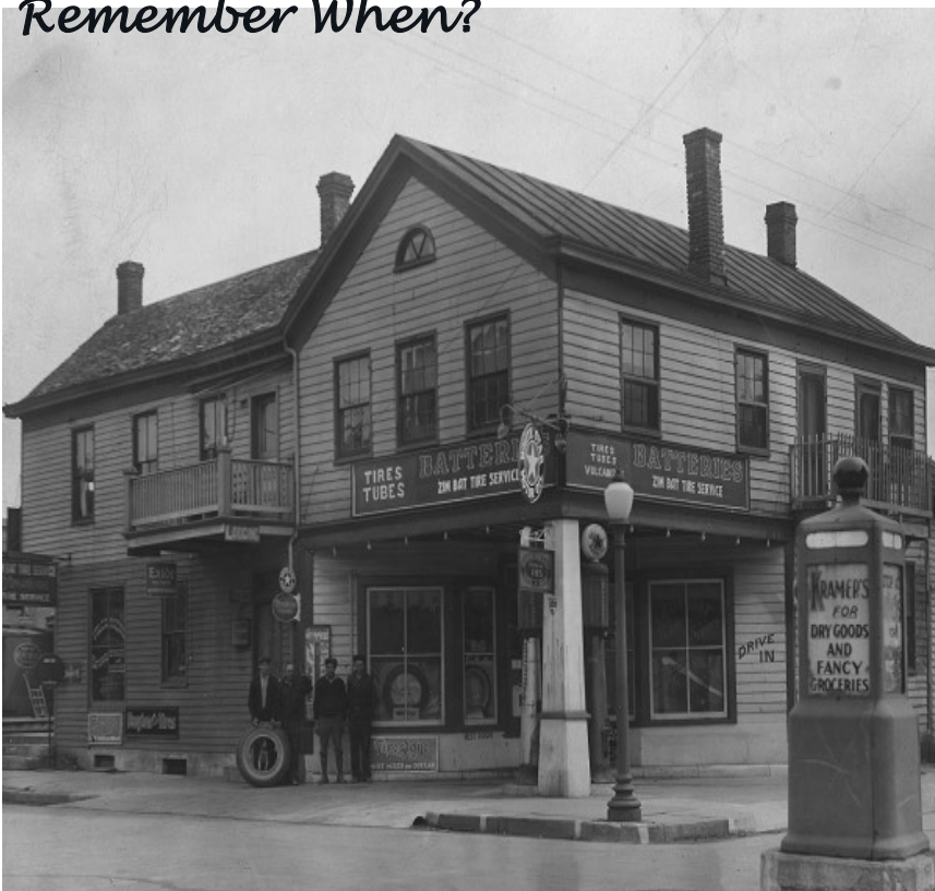
The Schene building was on the corner of Main and George Streets and was remodeled into an auto repair shop called Zim-Bat Tire Service by 1926. The owner later moved the station to George Street where Ken's Auto Repair is today.