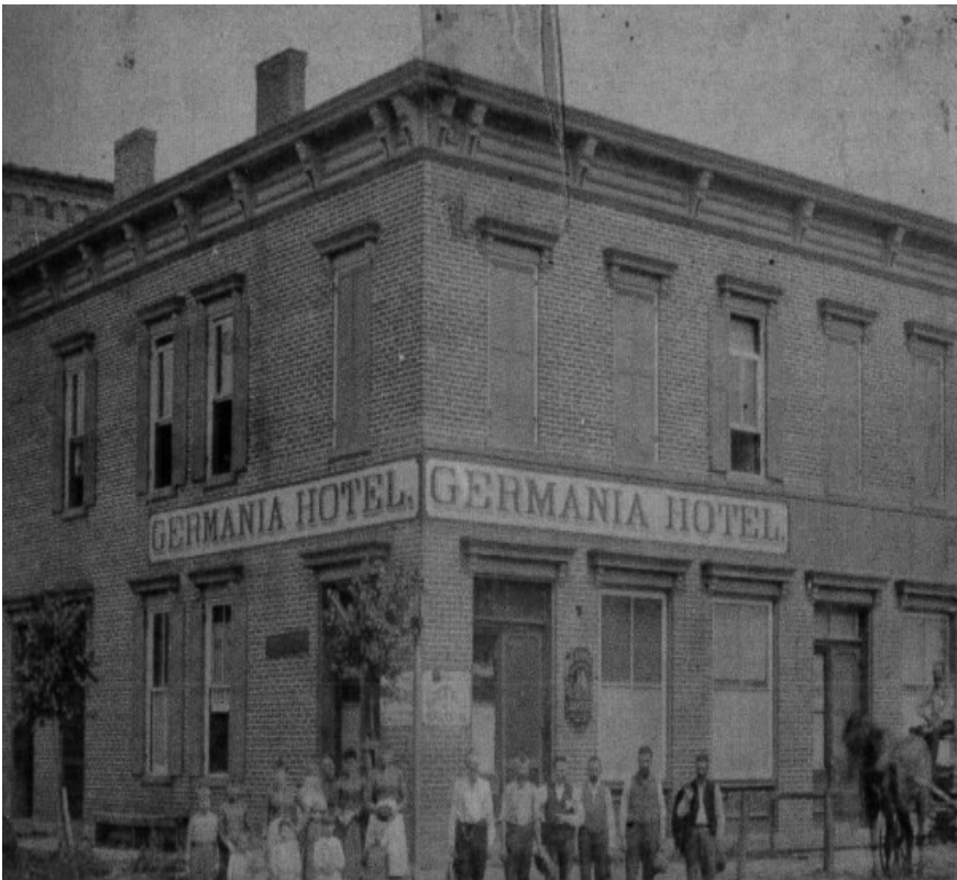
The Germania Hotel was built in 1887 and was situated across from the Sherman House on the corner of East Pearl and Main streets. The original owner was Victor Oberding and later JW Vonderheide. This photo was taken on December 17, 1887.